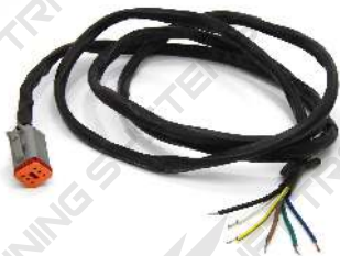
9 FOOT WIRE-HARNESS