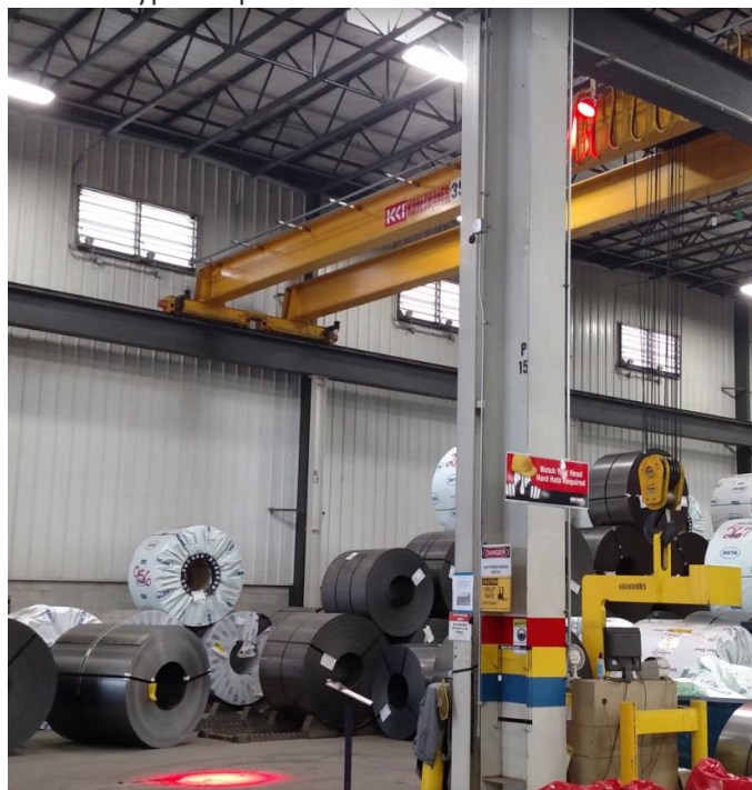
Single spot light configuration (available in red or blue)