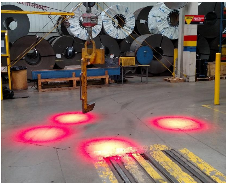
Four spot line configuration (available in red or blue or a mix)