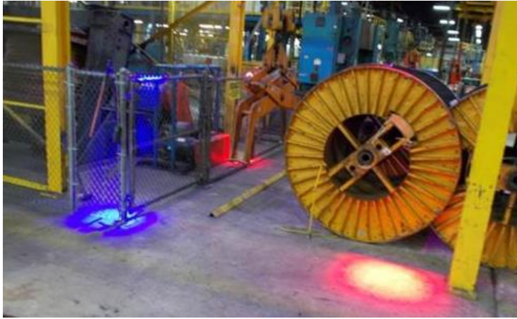
Two spot light configuration (available in red or blue or a mix)