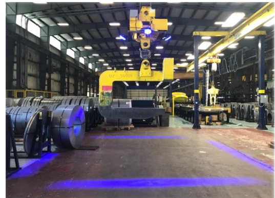
Quad line configuration (4 separate lights - available in red or blue or a mix)