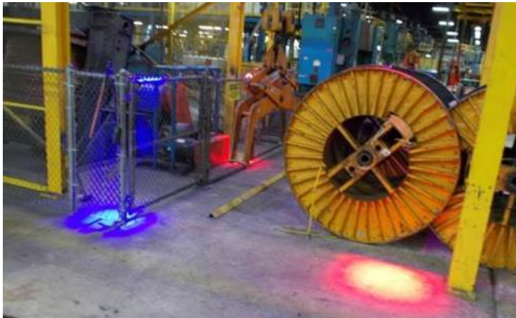
Two spot light configuration (available in red or blue or a mix)