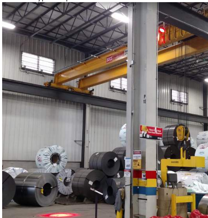
Single spot light configuration (available in red or blue)