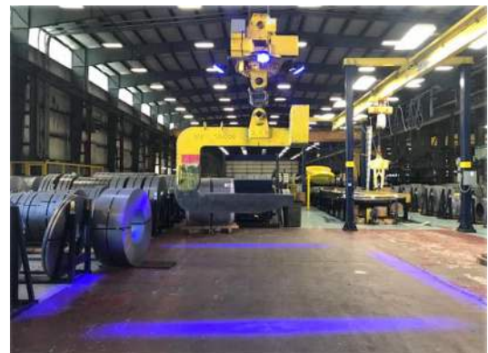
Quad line configuration (4 separate lights - available in red or blue or a mix)